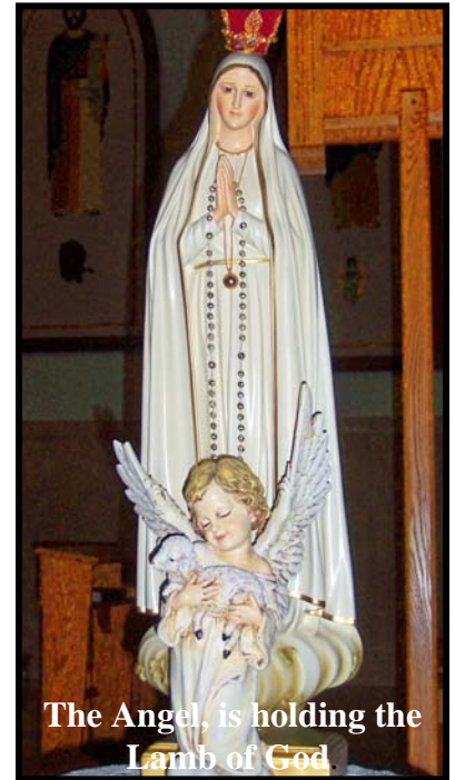
The Angel, is holding the Lamb of God.