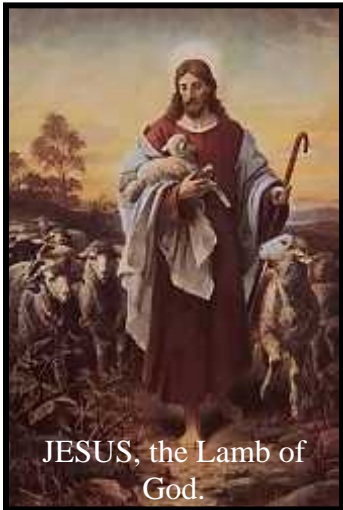
JESUS, the Lamb of God.