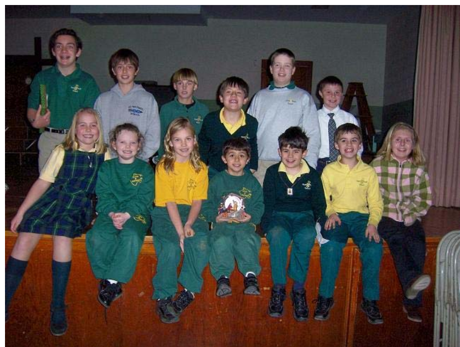
Here are the Armata Bianca children who pray for everyone this Christmas Season to have Jesus born in their hearts.

and the Omega, so he does not have an age now, he is eternal.